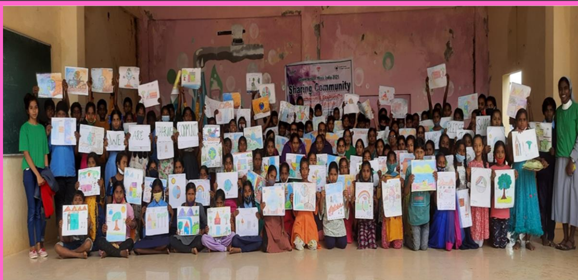
Drawing Competition conducted for the school children at Govt. Primary School Doddabanhalli, Bangalore

The Theme of the campaign was Consumerism and Eco-friendly Sustainable Lifestyle which aimed to sensitize, educate and motivate the people towards an eco-friendly living through reduced Consumerism, reduced resources wastage, and sharing or upcycling used resources. Awareness and knowledge of sharing resources and caring for Mother Earth was imparted to more than 97 Women and 95 students at Doddabanhalli school. CDEW distributed about 100 fruit trees in order to spread the message of conservation of our environment.