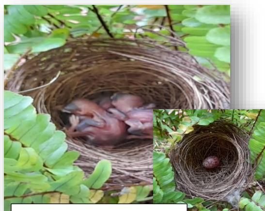
AUXILIUM WELFARE CENTRE